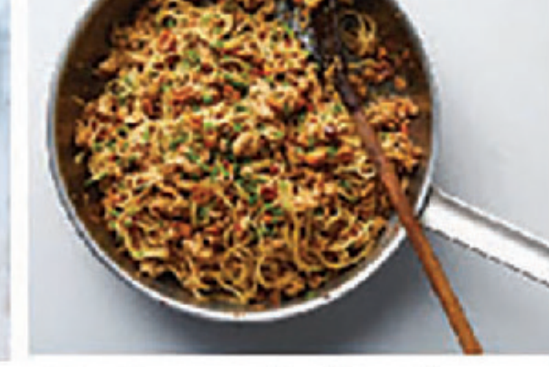
Spicy Sesame Noodle with Chicken & Peanuts