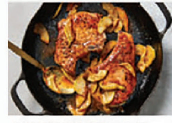
Skillet Pork Chops and Apples With Miso Caramel