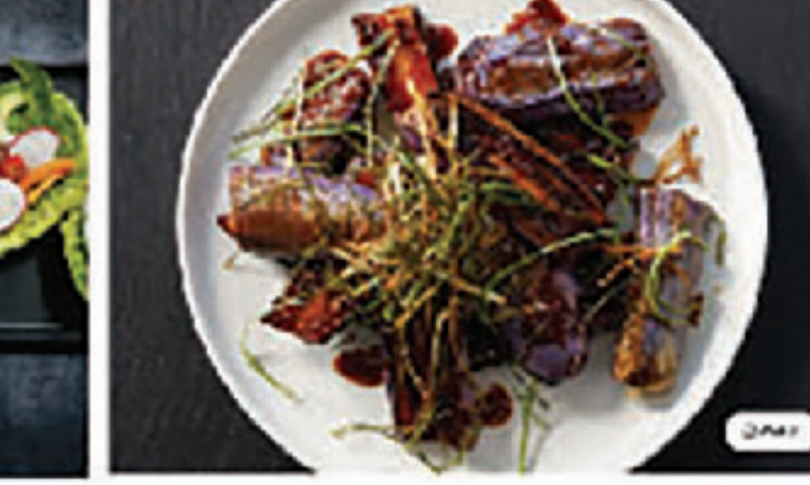
Gochujang Glazed Eggplant with Crispy Scallion